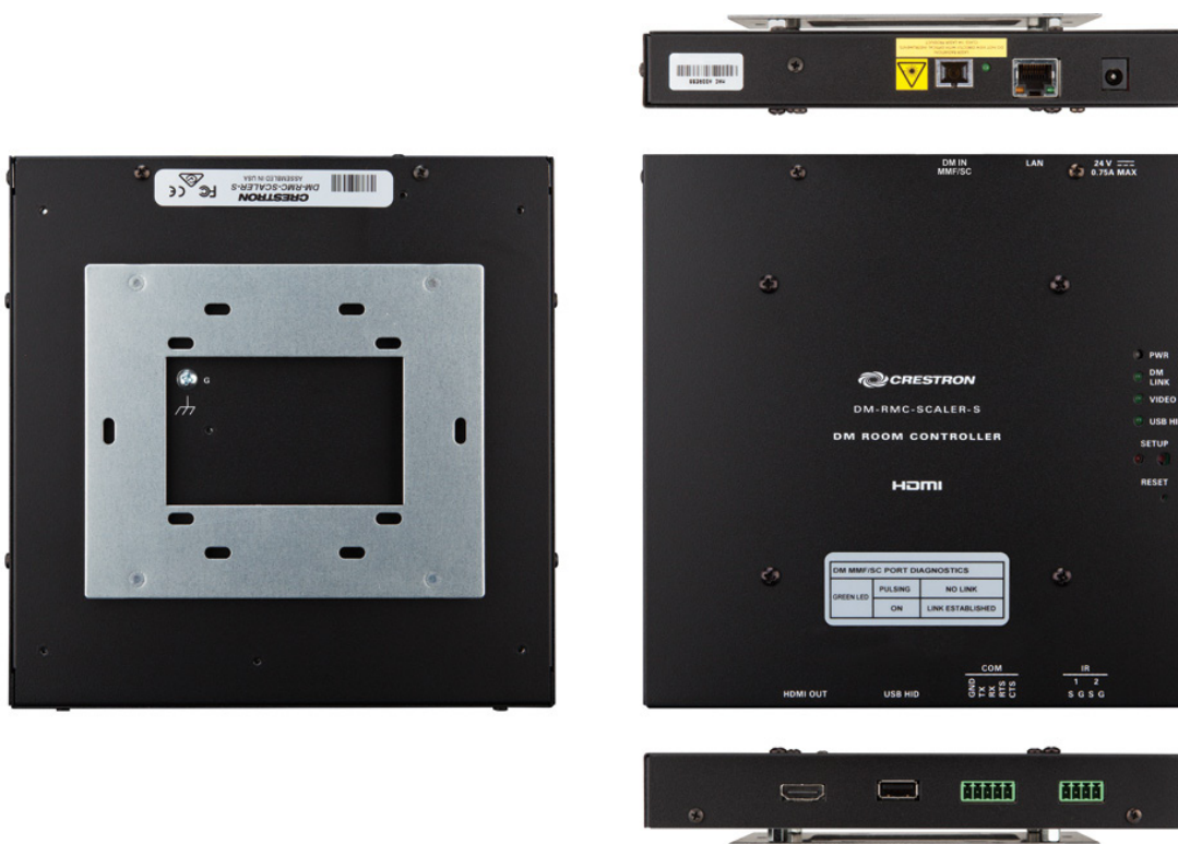
DM-RMC-SCALER-S – Rear, Top, Front, and Bottom Views