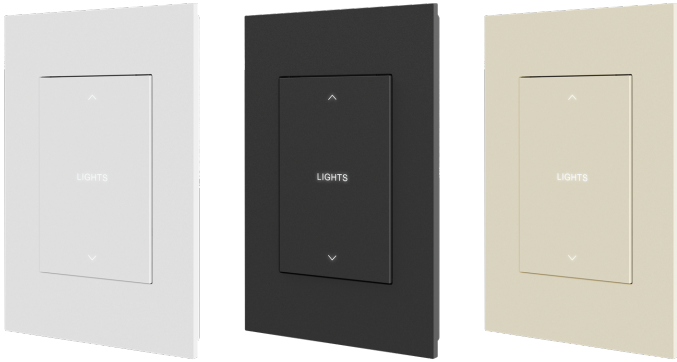
Shown with Custom Engraving on a Style 6 Button Assembly, Faceplate not included