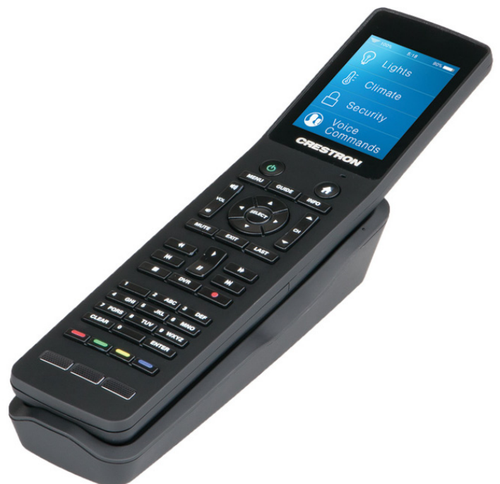
TSR-302-B – Shown with TSR-302-DS-B dock (included)

Transceiver: IEEE 802.11b/g/n Wi-Fi (2.4 GHz 2-way RF), static IP or dynamic IP via DHCP Security: 64 & 128-bit WEP, WPA™ & WPA2™-PSK with TKIP & AES Range: Up to 50 feet (15 m), subject to site-specific conditions Gateway: Requires a CEN-WAP-1500 or similar 802.11b/g/n wireless access point and Ethernet-enabled Crestron control system