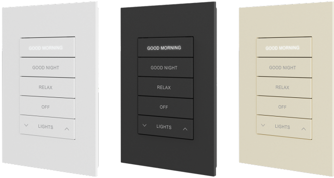
Shown with Custom Engraving on a Style 1 Button Assembly, Faceplate not included