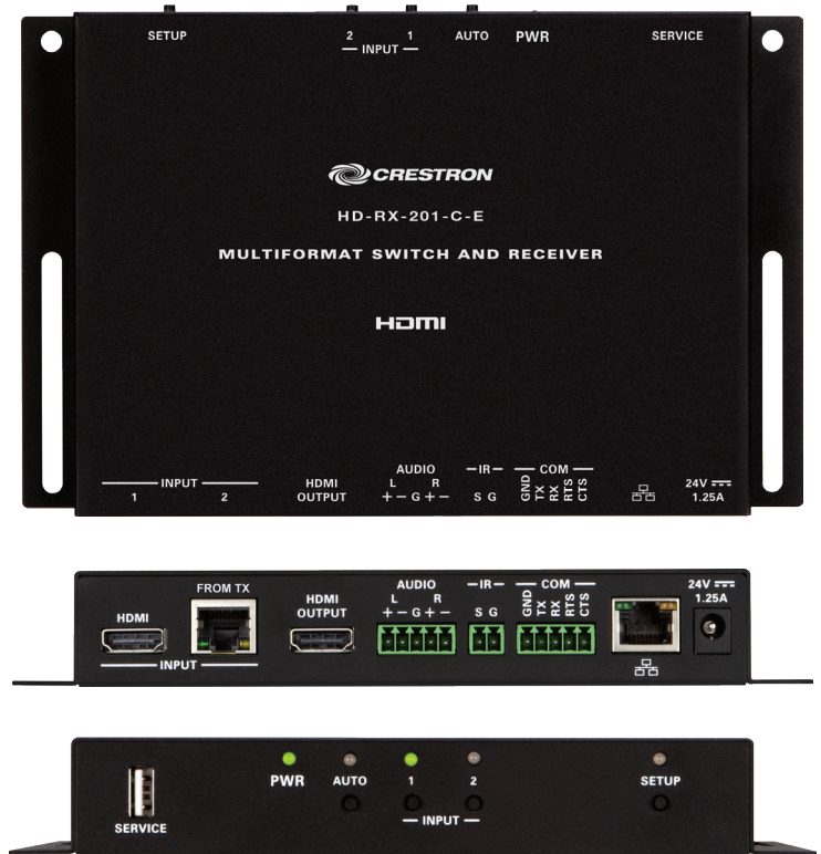
HD-RX-201-C-E Receiver – Top, Front, & Rear Views

input enables plug-and-play simplicity, supporting HDMI, DVI, or Dual-Mode DisplayPort signals via any HDMI input, and VGA, RGB, or component video signals via the VGA input. [2,3] The analog audio input is switched in tandem with the VGA input. [4] The auto-switching behavior can be configured using “priority routing” mode, allowing the installer to define which inputs take precedence over other inputs when connecting multiple sources.