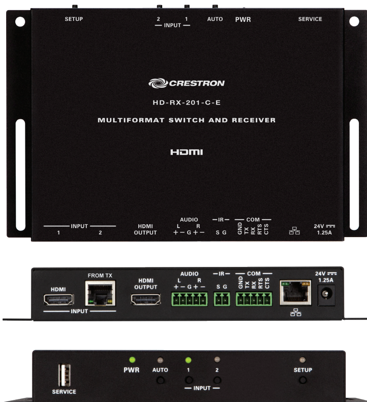
HD-RX-201-C-E Receiver – Top, Front, and Rear Views