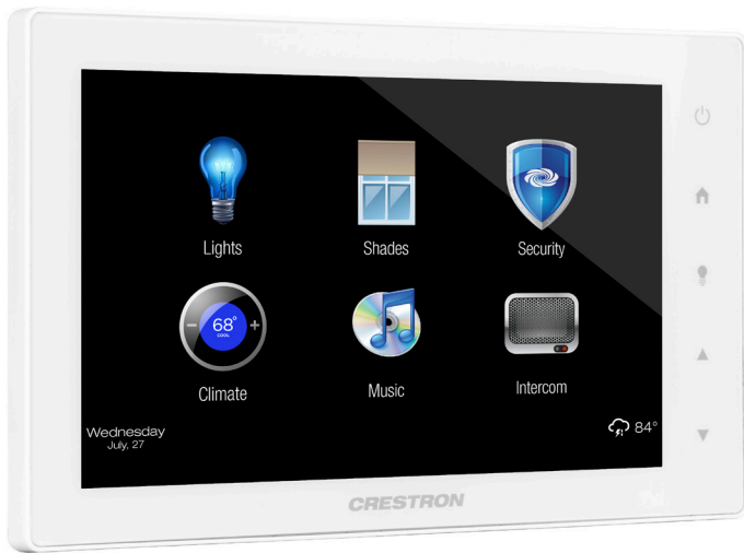
TSW-750-W-S – Shown in White