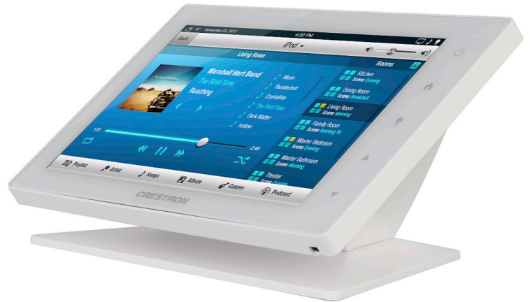
TSW-750-W-S with TSW-750-TTK TableTop Mounting Kit