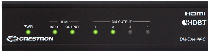
DM-DA4-4K-C – Front View