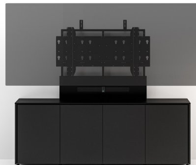
Salamander Designs Credenza, Siena Black Oak

All pieces are built to order, manufactured in the USA and backed by a Lifetime Warranty. Customize your own by selecting from our wide variety of styles, materials, sizes and finishes of furniture to support technology, unified communication and maximum user engagement with designer style.