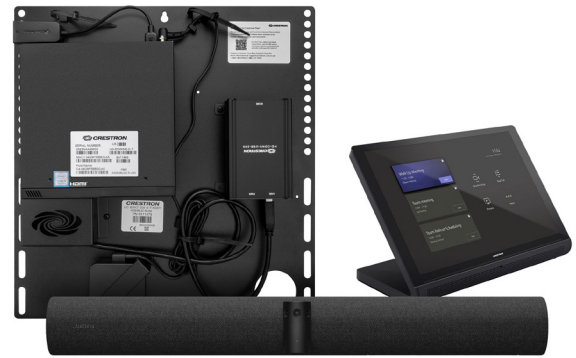
Crestron Flex Small Room Conference System (UC-B31-T)

The UC-B31-T Crestron Flex tabletop conferencing system provides a small room video conference solution for use with Microsoft Teams® Rooms software. It supports single or dual video displays 1 (not included) and features a tabletop touch screen, Jabra® PanaCast 50 video bar, UC bracket assembly, PoE injector, and cables.