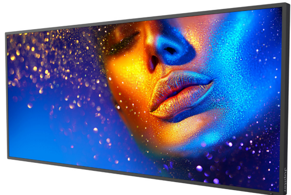
Jupiter Pana's 21:9 ultra-wide 5K (Pana 105")

We believe that 21:9 ultra-wide 5K LCD are the future for enterprise and are committed to leading the way in this space. The Pana is fully engineered and designed from the ground up by Jupiter; this allows us to work with market leaders such as Microsoft to create a fully integrated Signature Teams Room display and solution. Jupiter Pana displays are installed at over 50 Fortune 500 companies in over 22 countries (and growing), many in the Microsoft Signature Front Row MTR configuration.