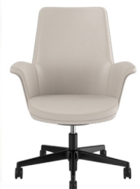
Humanscale® Summa Chair